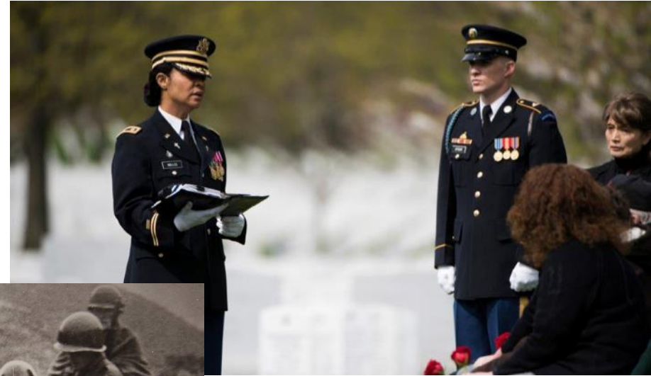
Honor the Fallen