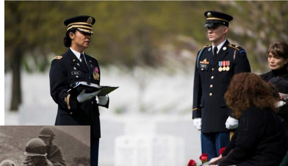
Honor the Fallen