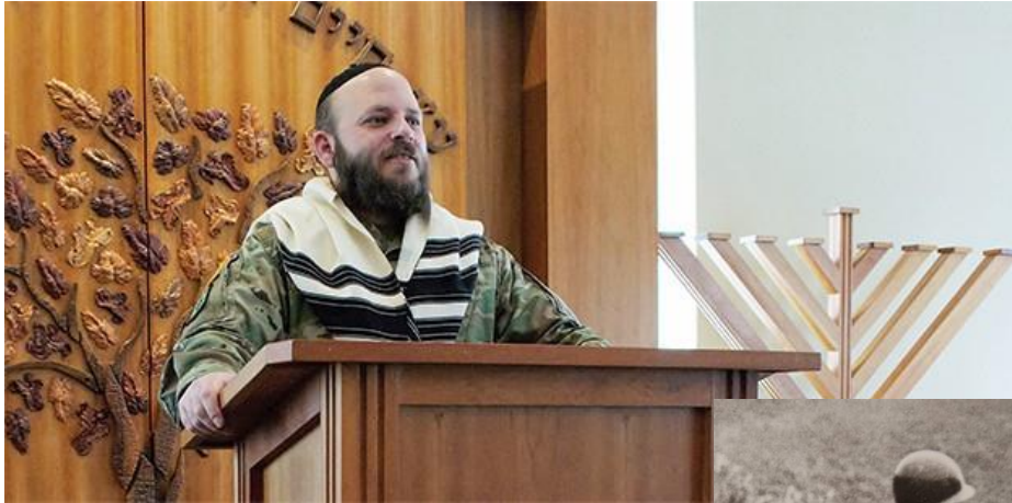
Nurture the Living