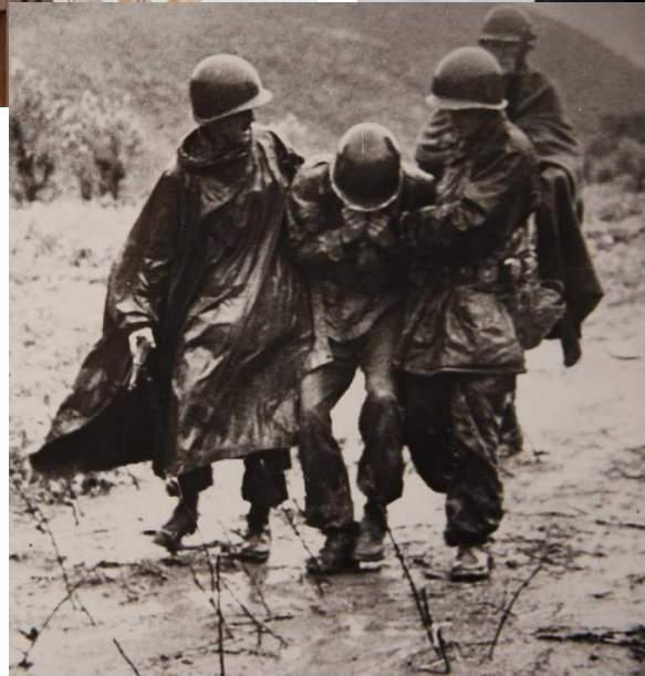
Care for the Wounded